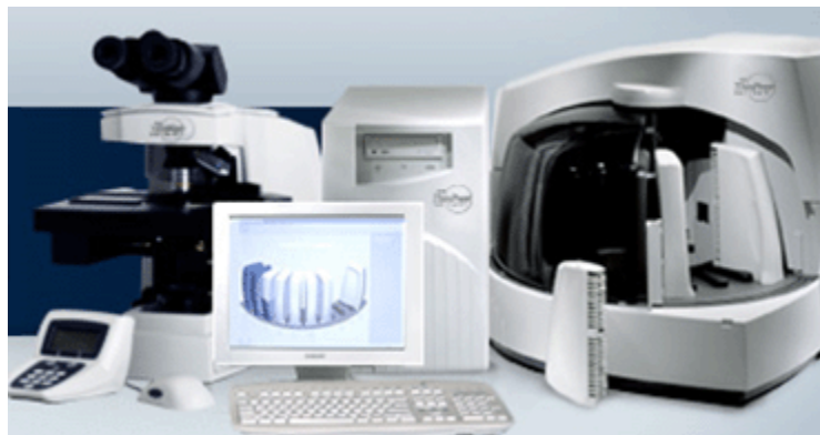
ThinPrep Pap Test liquid-based slide: improvement over the conventional pap smear